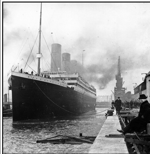
RMS Titanic II at the docks

Pack your riding gloves and a warm scarf for the views on the promenade deck of the R-101 because we're off to the Sudima Hotel at Rotorua for Easter weekend, 3rd - 6th April 2015.