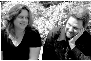
Pip & Tee